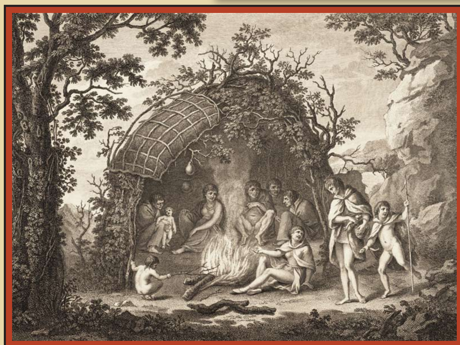
Top: Native Fuegians, drawn by Conrad Martens, from Robert Fitzroy, Narrative of the surveying voyages of His Majesty's ships Adventure and Beagle, 1839